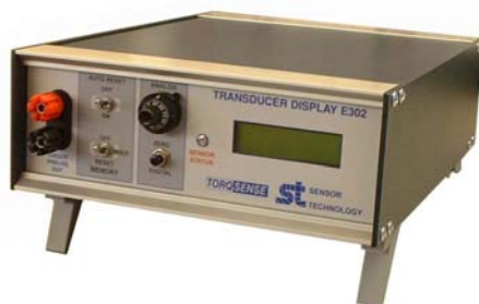
A typical E Series Transducer Display unit. Front panel varies depending on model. See over page for sizes.