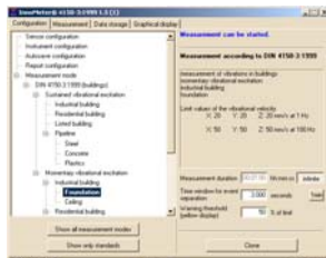
Select the measurement mode