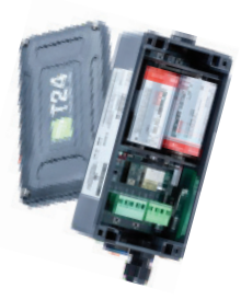
T24-AR Wireless range extender repeater module