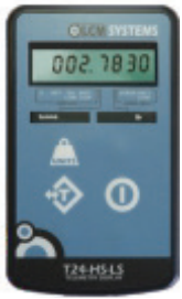
T24-HS-LS Simple wireless display for connecting to 1 load cell