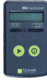
T24-HR Wireless display for connecting to multiple load cells