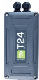
T24-BSi Wireless USB, RS485, RS232 connected base station