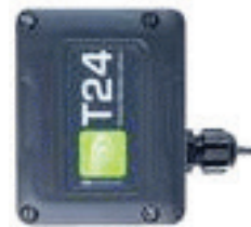
T24-BSue Wireless USB extended range base station