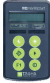
T24-HA Wireless display for connection to up to 12 load cells