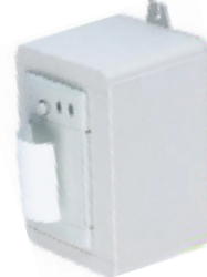
T24-PR1 Wireless surface mounting tally roll printer