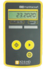
X24-HD ATEX Wireless display for connection to up to 24 load cells