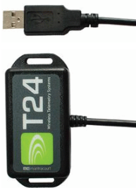
T24-BSu Wireless USB connected base station