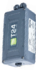
T24-SO Wireless serial ASCII output module