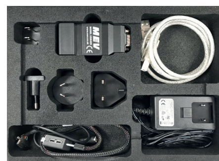
DMU41 EVK Evaluation Kit (P/N DMU41-00-0500)