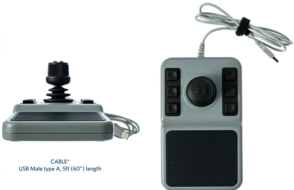
CABLE* USB Male type A, 5ft (60") length

* Note: The MFD Series is configured with a black USB cable. The gray cable in product image is not representative of the final product.