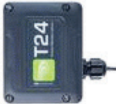
T24-BSue Wireless USB extended range base station