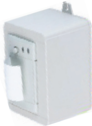
T24-PR1 Wireless surface mounting tally roll printer