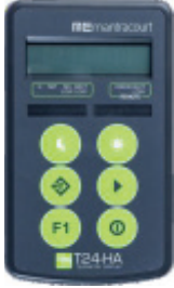
T24-HA Wireless display for connection to up to 12 load cells