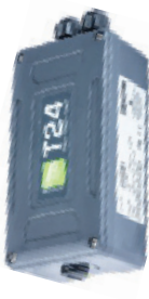
T24-SO Wireless serial ASCII output module