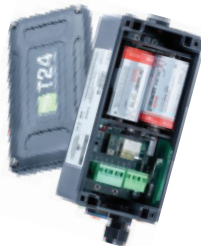
T24-AR Wireless range extender repeater module