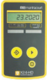
X24-HD ATEX Wireless display for connection to up to 24 load cells