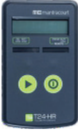
T24-HR Wireless display for connecting to multiple load cells