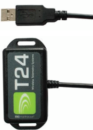
T24-BSu Wireless USB connected base station