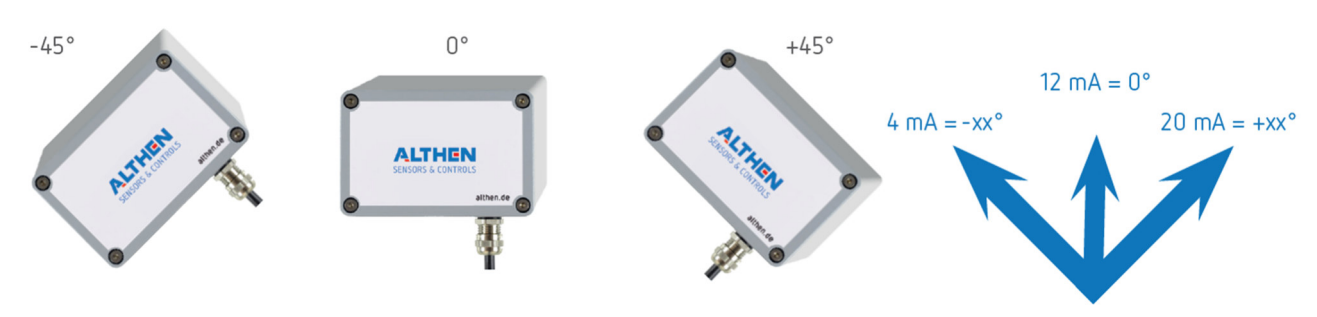
Version 0 ... Bxx°

(Note: Example shows an inclination of 0 ... 90°)