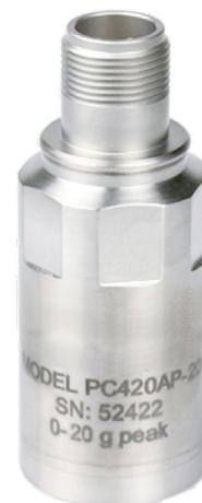
Table 1: PC420Ax-yy model selection guide

PC420A series sensors provide a 4-20 mA output proportional to vibration, allowing for continuous trending of overall machine vibration. This trend data alerts users to changing machine conditions and helps guide maintenance in prioritizing the need for service. The choice of RMS or peak output allows you to choose the sensor that best fits your requirements.